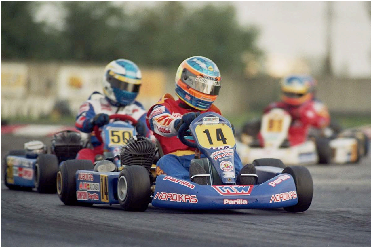
(Fernando Alonso, 1998)