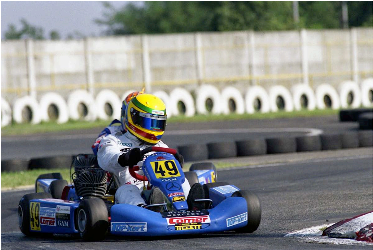
(Lewis Hamilton, 1999)

Among the protagonists of the Trofeo, three drivers went all the way to become Formula 1 World Champions: Fernando Alonso (2005-2006), Lewis Hamilton (2008) and Sebastian Vettel (2010-2011-2012-2013). In the nineties, the number of drivers partaking in this event became quite remarkable, with the record of 261 entered drivers in the first round of 1993, and a total of 718 drivers in the three races run in that year.